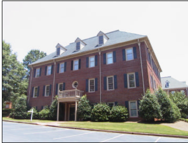
Governor's Ridge Office Park Building #6